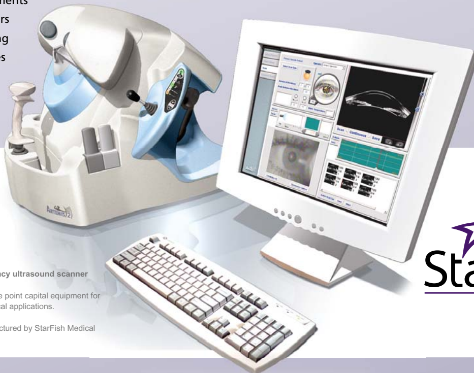
Artemis high frequency ultrasound scanner

Product Management New Product Introduction Turnkey Volume Production Sustaining Engineering Regulatory Submissions IP Guidance and Filings Joint Ventures